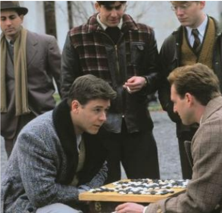
Realistic Lighting Design